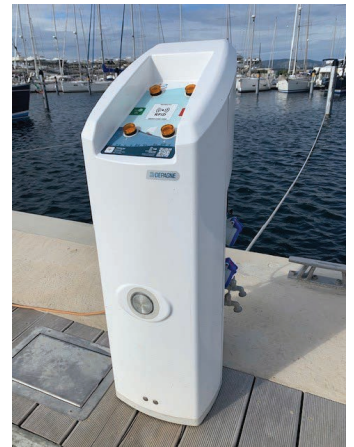
Example of personalised installation Sourcelec 278, Port Leucate, France

This system provides a long-range communication and the safety of the installation with various means of configuration.